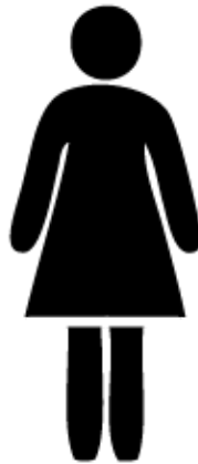
How your Factory sees it