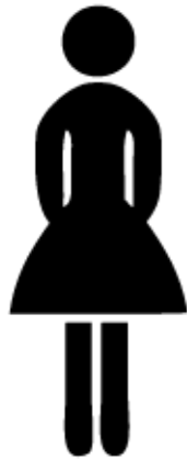
How your Agent sees it