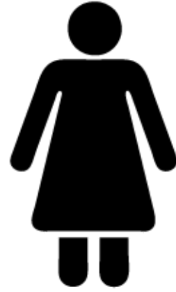
How Sewing worker sees it